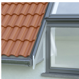
Long overhang boxed eaves