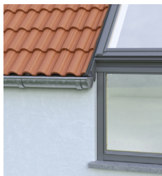
Flush eaves detail