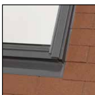
SLATE FLASHING | KSF for 0-16 mm (2 x 8 mm)