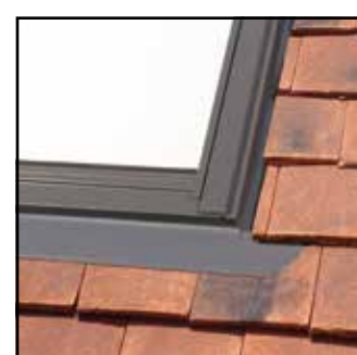
PLAIN TILE FLASHING | KFP for 0-28 mm (2 x 14 mm)