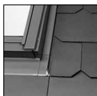
SLATE FLASHING | KLS for 0-16 mm (2 x 8 mm)