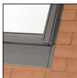
FLUSH FLASHING | KFF for 0-16 mm (2 x 8 mm)