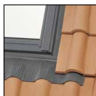
UNIVERSAL FLASHING | KUF for 16-120 mm