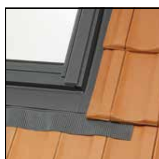
TILE FLASHING | KTF for 16-50 mm